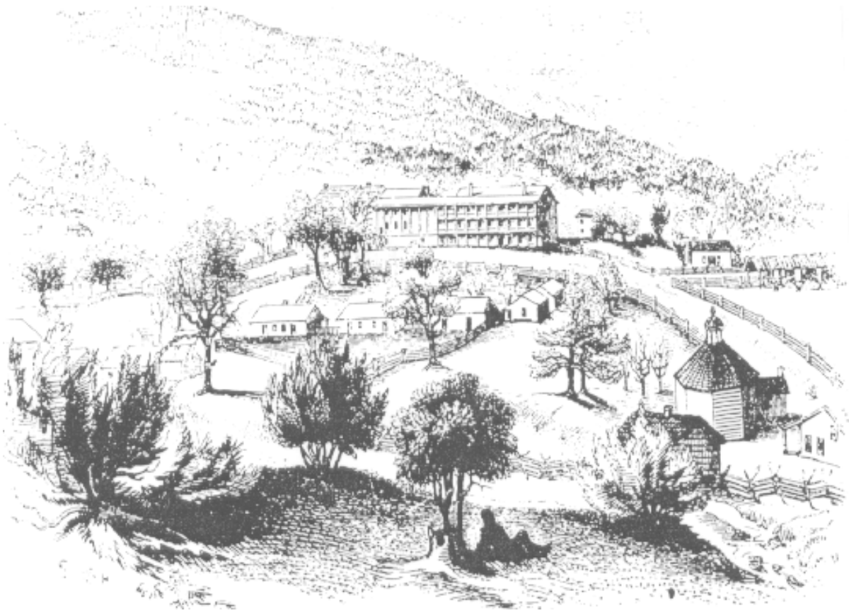
Figure 2. The Hot Springs resort as drawn by Porte Crayon in 1857. The large hotel is The Homestead, built by Thomas Goode in 1846.