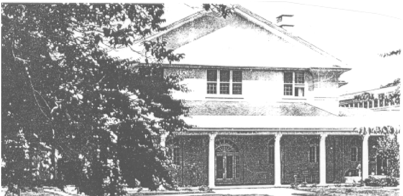
Figure 3. The spa at The Homestead, built in 1892 and still offering full-time health treatment for the guests. It has been extensively remodeled.