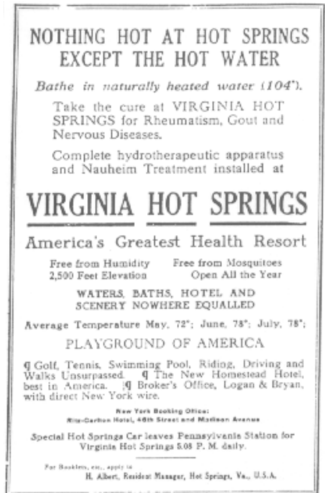
Figure 1. Early poster advertising the Hot Springs.

Hot Springs became one of the dominant resorts of Virginia after Thomas Goode, a physician acquired it in 1832. He was a salesman who exaggerated the benefits of the mineral waters, claiming that it would cure most diseases or relieve the symptoms (Figure 1). He expanded the resort and opened a hotel called The Homestead in 1846--the site of the present day hotel (Figure 2). He also built cabins and bathhouses that attracted many notable people. The resort became one of "the" spas on the summer circuit for the south (Cohen, 1981).