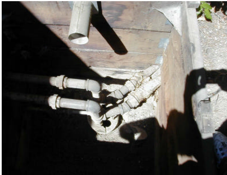
Well with three DHEs, a single 2-in. (5-cm) pipe used for space heating and two 3/4-in. (2-cm) pipes used for domestic hot water.