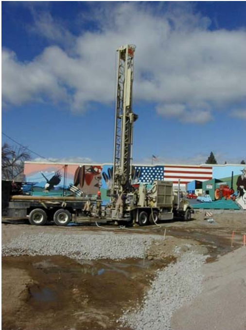
Figure 2. Photograph of drilling activities

layers. The drilling was accomplished using air-rotary methods (Figure 2).