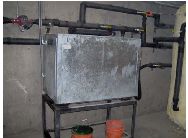
Figure 3. Photograph of the 15 ton water-water heat pump serving the entire building. Note the storage tank on the right.

Because the building has no operable windows, all ventilation air is provided by mechanical means. A heat-wheel type air handling unit with a nominal capacity of 4000 cubic feet per minute (cfm) (6,800 m 3 /hr) is installed in the attic space, together with ducting to distribute the air to each zone. At the zonal level, occupancy sensors operate a damper in the ventilation duct to minimizing the air handled by the fan system. These occupancy sensors also control lighting in the individual zones. The fan speed is modulated by means of variable frequency drives.