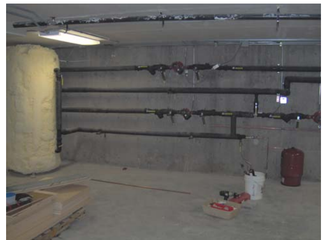
Figure 4. Photograph of the mechanical room, showing the distribution piping and storage tank.

The building's hydronic circulation pumps are in-line centrifugal types, with variable frequency drives that are controlled based on pressure in the supply pipe. At the heat pump, the ground loop pump is also controlled with a variable frequency drive. The tank circulation pump between heat pump and thermal storage tank is constant speed.