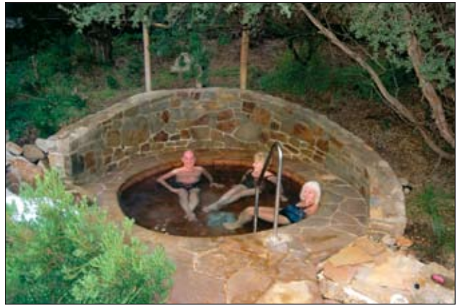
Small soaking pool.

This, coupled with features gleaned from overseas, provided a diversity of cultural bathing experiences with quiet spaces and tranquil places for discovery and creativity.