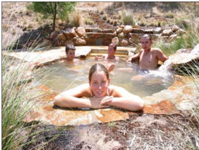
Small soaking pool.