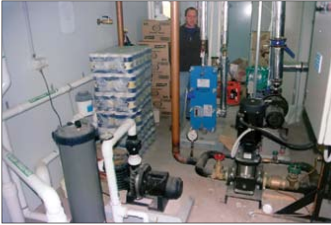
Well and heat exchangers.