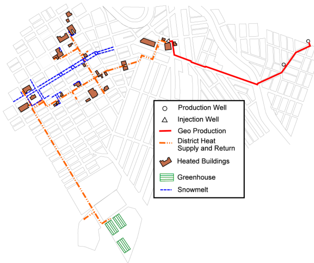
Figure 1. Klamath Falls Geothermal District Heating system location map, 2005