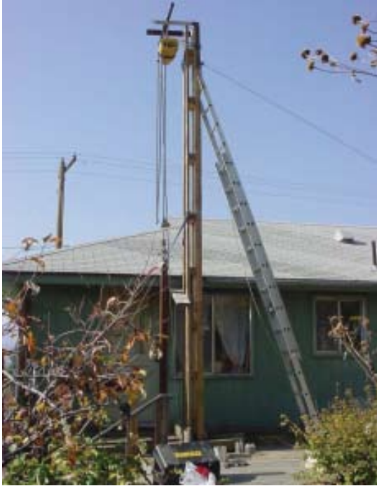
Figure 1. Photograph of removal of old black iron DHE.

Two PEX loops of 1-inch nominal diameter pipe were installed. In addition, a single 3/4-inch red PEX tube was also installed with the DHE to act as an access tube for well temperature monitoring and also to act as a convection promoter. To promote convection of hot water within the well, the 3/4-inch PEX tube was perforated at its lower end and at the level of the water table.