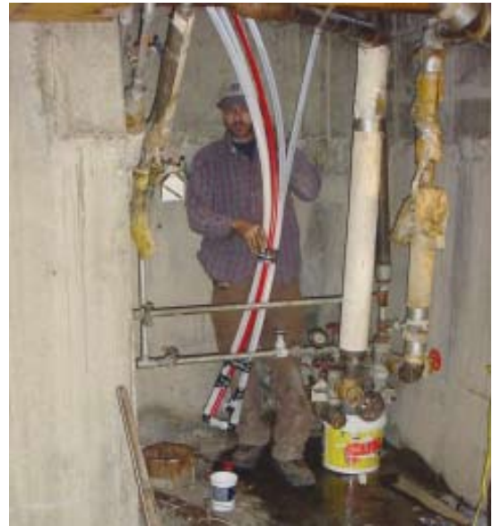
Figure 3. Photograph of double u-tube PEX DHE assembly prior to insertion into the well with dark (red) promoter pipe.