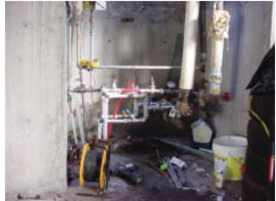
Figure 4. Photograph of the completed double u-tube PEX DHE.

A photograph of the entire PEX DHE assembly prior to insertion into the well is shown in Figure 3. The final installation is shown in Figure 4. The entire installation process of the PEX DHE into the well was completed easily in less than an hour with three people.