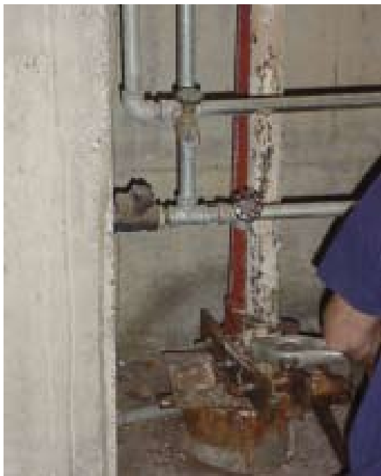
Figure 2. Photograph of removal of old black iron DHE, showing heavy scale deposits and corrosion.